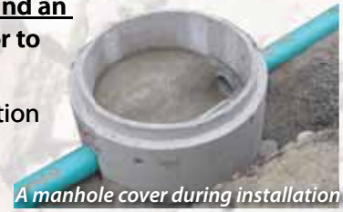
A manhole cover during installation