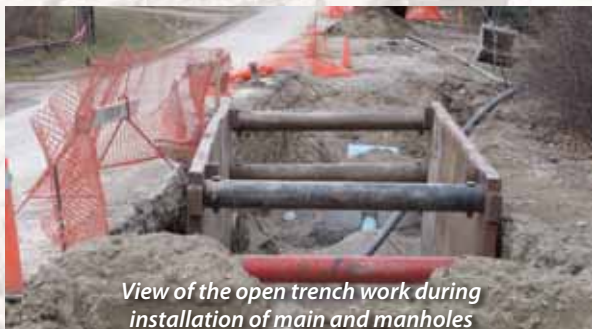
View of the open trench work during installation of main and manholes

To schedule the required connection inspection, receive the necessary forms, and activate an account, contact WWSC at 250-342-6999 PRIOR to connection.